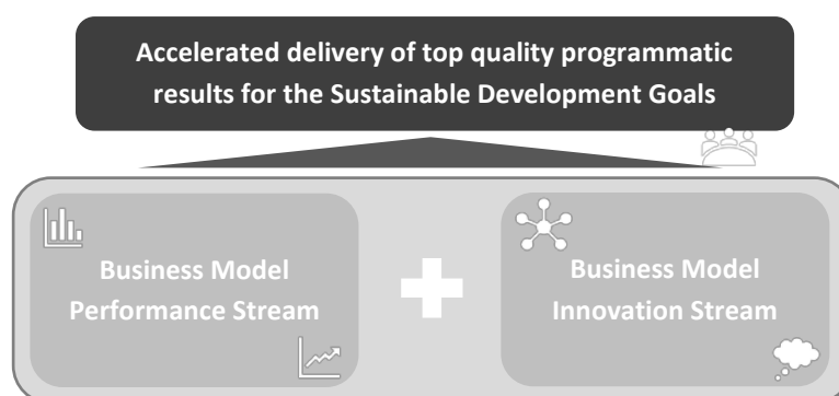
Figure 2. Accelerated delivery of top-quality programmatic results for the Sustainable Development Goals

66. UNDP country offices are the programmatic and operational backbone of the organization and will be central to the two streams of work, as well as key beneficiaries of the outcomes. The improved business model will empower country offices to deliver the services requested of them within their diverse operating contexts, in a manner that is financially sustainable.